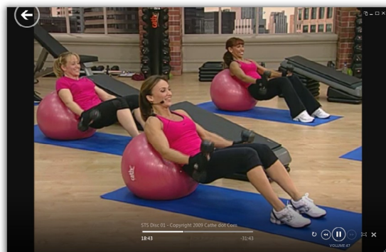
Viewing your video within Zune desktop software